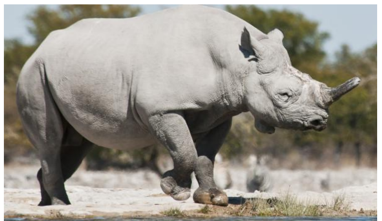
A rare sight, an elderly Black Rhino living to a ripe old age in Namibia.

Next issue: Dr Taylor discusses the current status of the modern Rhino, and summarises the state of Rhino poaching, and the successes against it.