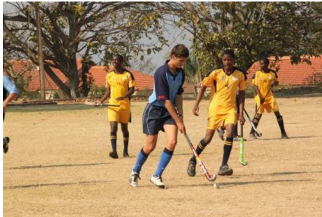
Stokies and no shin pads—einal!

This is also an worthy opportunity for corporate sponsorship. So clear out your cupboards and contact Bianca at biancablack@vodamail.com if you can help.